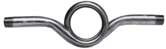
Coil- used primarily for horizontal installations

Approximately 75° F for each 12" section of ½" pipe. Actual reduction dependent on process/application variables.