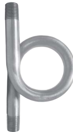
Pigtail- used primarily for vertical installations